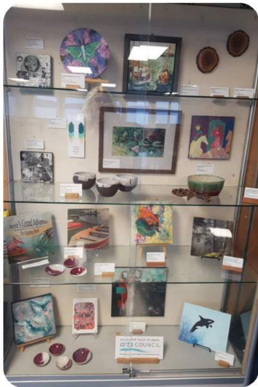
Floating Gallery display on the Salish Raven

In terms of involvement with the SGIAC, numerous Galiano artists have appreciated the broad exposure of the Floating Galleries on BC Ferries and they are looking forward to the next Arts on the Islands Regional Exhibition scheduled for 2023.